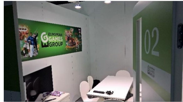
Impressions from 2015 and 2016