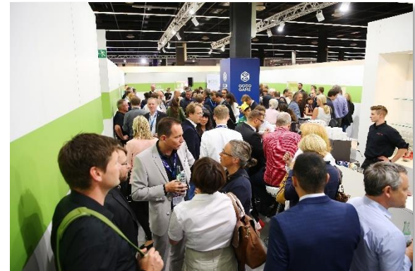
Impressions from 2015 and 2016